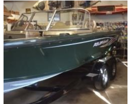
Boat of the Month: This versatile Polar Kraft will take you safely on Lake Erie fishing trips.