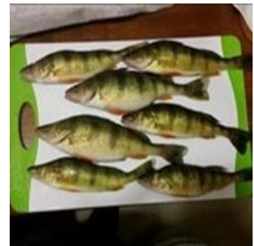
Dan Druschel's catch